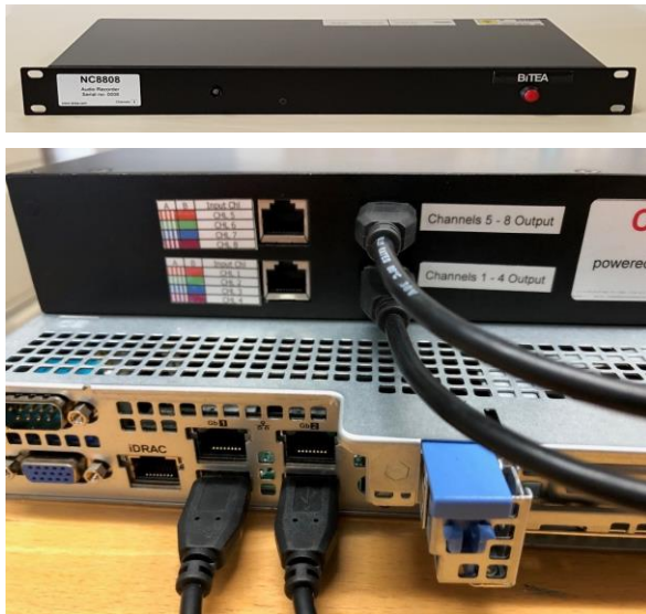
Designed from an original concept for the Radio Communications Department of Dorset Police

The BiTEA Audio Streamer serves to stream audio across the internal network to individuals desktop computers and computer devices such as iPads, Tablets and Smartphones on demand.